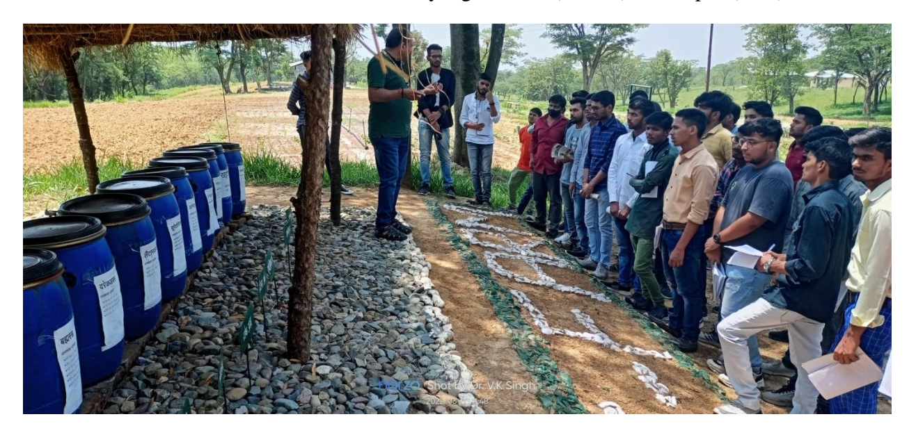
KVK, Kangra, Palampur (H.P.)